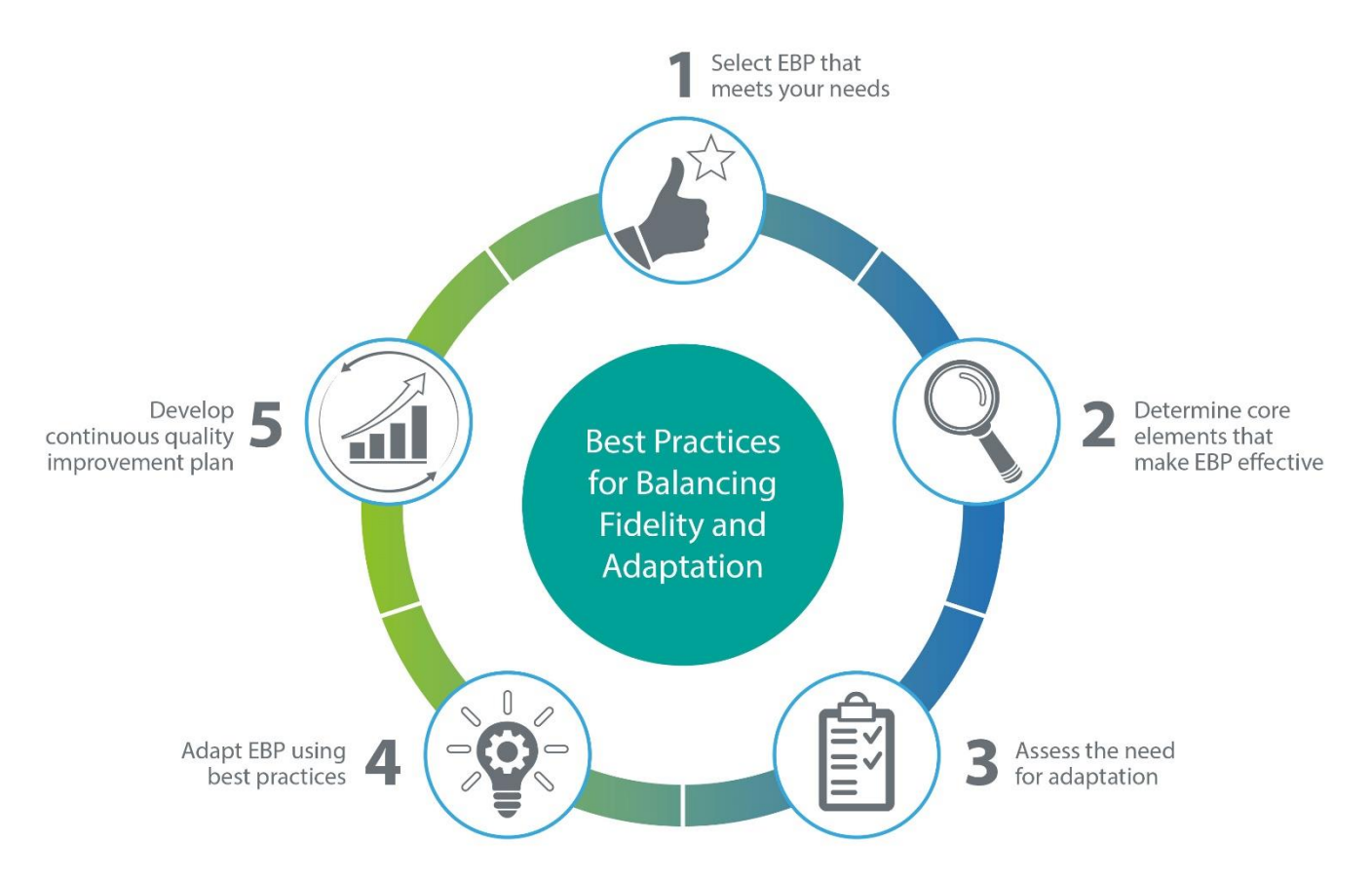
Figure 1. This model outlines strategies that organizations delivering evidence-based programming (EBP) can use to assure they are staying true to the program's core elements while also meeting the needs of their community.