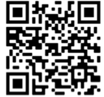
Evaluation Form QR Code

To complete the evaluation form, go to https://ttc-gpra.org/P?s=317583 or scan the QR code.