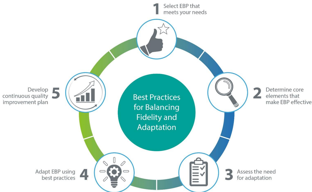
Figure 1. This model outlines strategies that organizations delivering evidence-based programming (EBP) can use to assure they are staying true to the program’s core elements while also meeting the needs of their community.